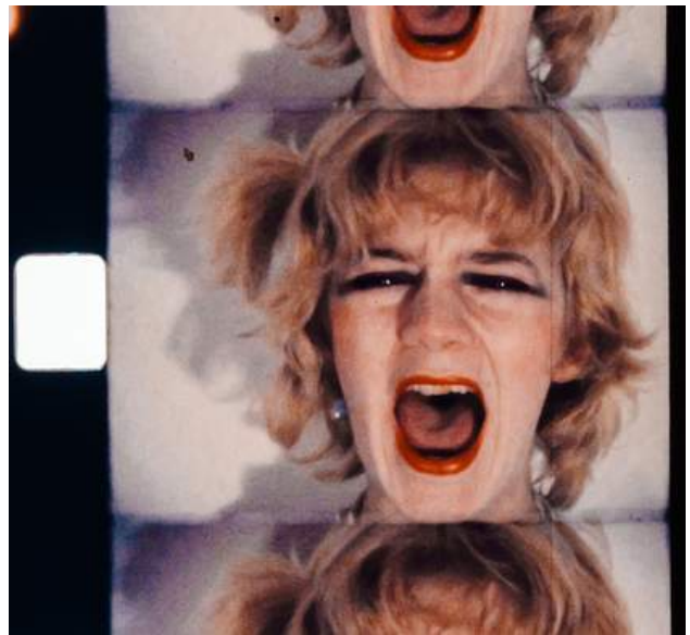
Women In Revolt! Art, Activism and the Women's movement in the UK 1970–1990