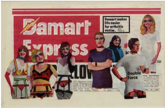
ARTIST Linder born 1954